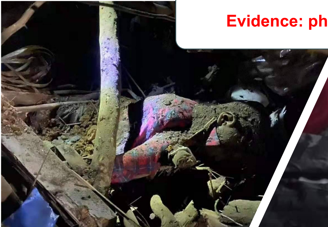
Evidence: photographs of casualties