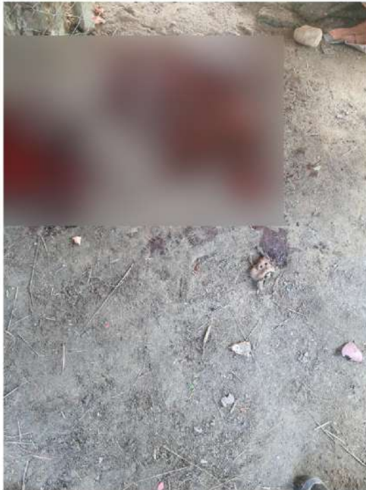
Image (4) - Pieces of Flesh from Ma Pwint Phyu Zar Win, killed by the air attack (27)