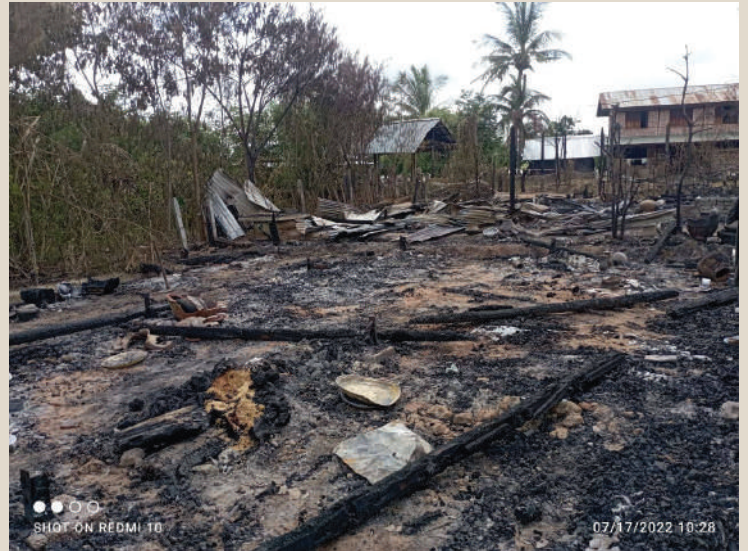
Image (4) – Photo of Kone Tae Village burnt down by the military troops