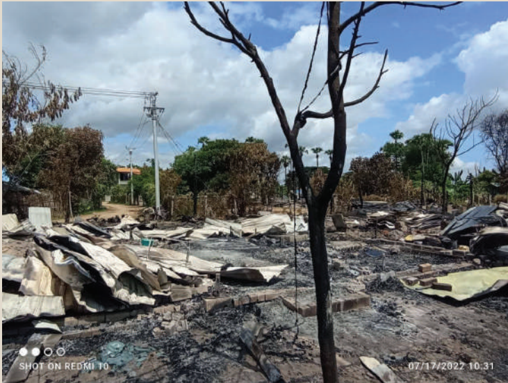
Image (3) – Photo of Kone Tae Village burnt down by the military troops