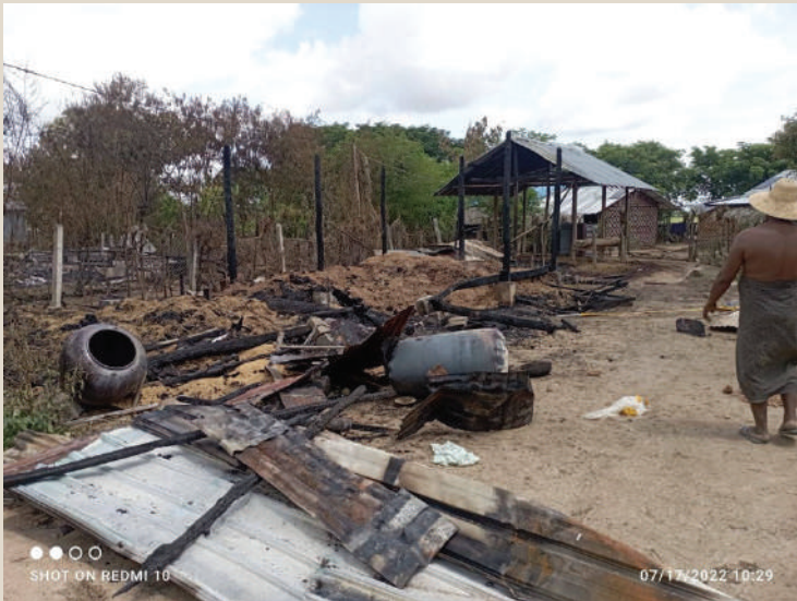
Image (5) – Scenes inside Kone Tae Village after being burnt down by the military troops