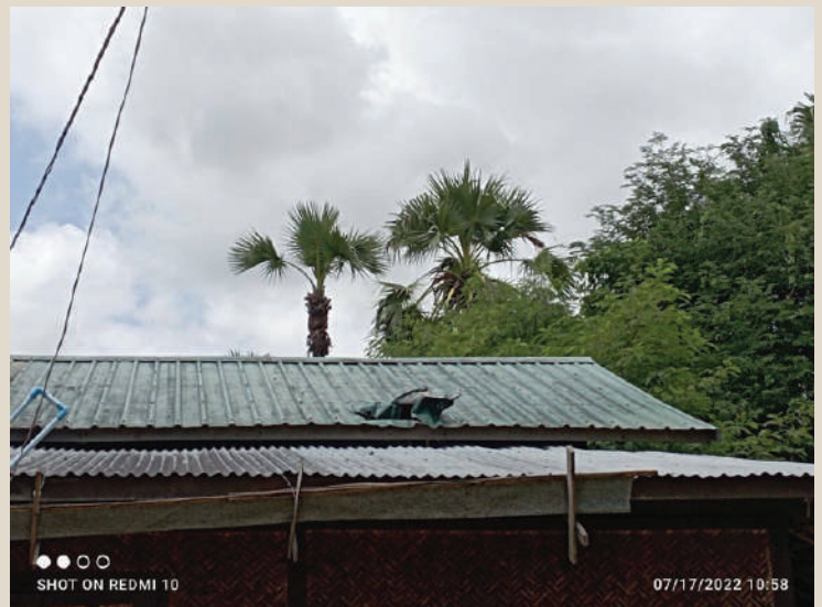
Image (2) – House of a villager which was attacked by heavy artilleries