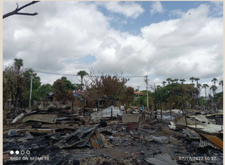
Image (6) – Scenes inside Kone Tae Village after being burnt down by the military troops