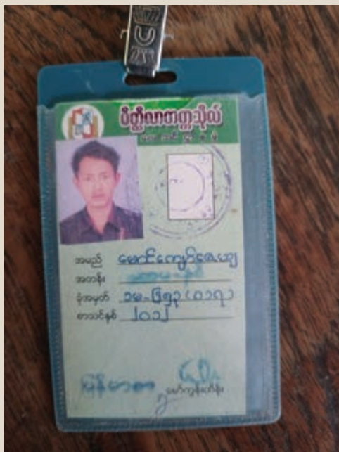
Image (1) – A Student Identification Card left by an SAC personnel (Front)