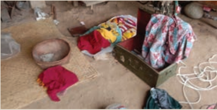
Image (4) – Scene of a house in disarray after the military troops' search for valuable items to take