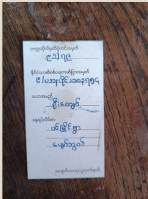
Image (2) – A Student Identification Card left by an SAC personnel (Back)