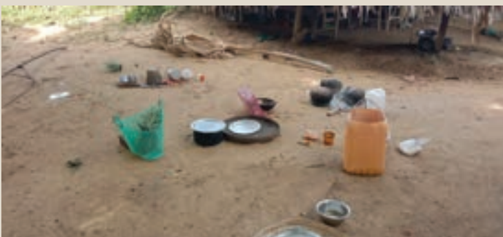
Image (7) – Utensils from villagers' houses left by the military troops after their meals