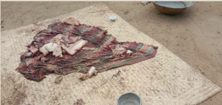
Image (5) – Scene of village after being destroyed by the military troops