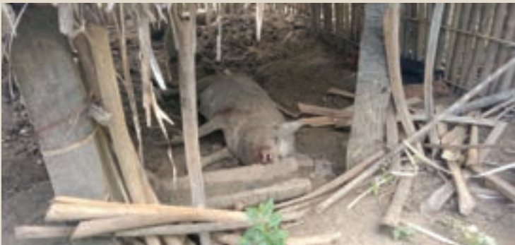
Image (6) – Scene of village after being destroyed by the military troops