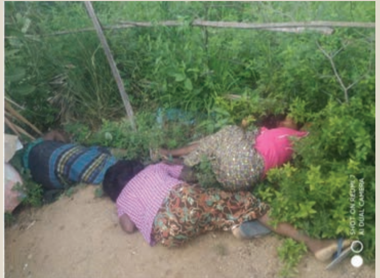
Image (8) – Dead bodies of Daw Nyo Kyin, Daw Aye Win and Ma Moe Yi who were hiding in toilets, died from gun shots